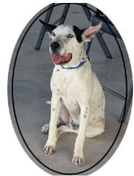
Introducing Polo, the newest member of the Hacienda los Árboles security team.

Adele +52 1 662 363 0470 Wade +52 1 662 358 6870 hammondhotline@gmail.com