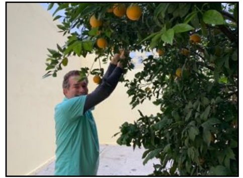
Our first ever orange harvest ...and it was conveniently located just one meter outside our back door.

English classes continue to grow. Almost every week she is receiving requests to join her classes. 😊 Finally, we are excited to share that we received some donations towards the upgrading projects at the Hacienda los Árboles Retreat Center. Materials have been ordered and the real work will be starting next week. (Pictures will be included in our next update.)